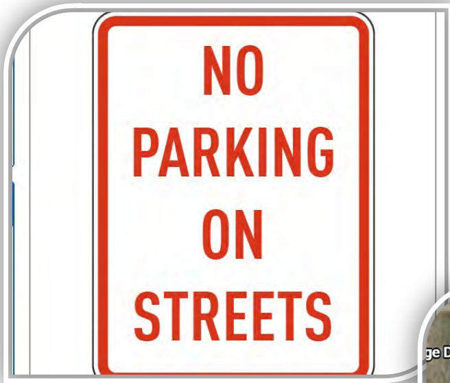
Photo Description: All (4) entrance signs were pressured washed prior to holiday light install.